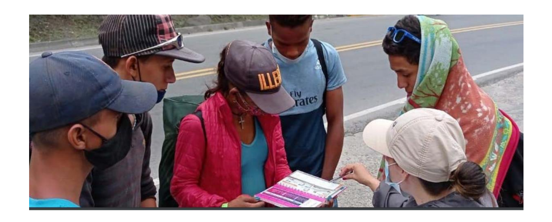
Gender Sensitive Approach Iterative Adaptive Approach